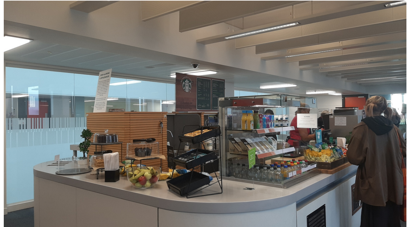
Yep, that's a real Starbucks inside the BCU buildings - one of many actually!